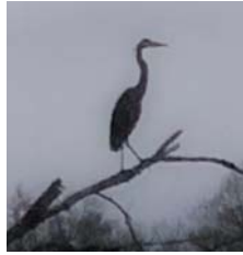
"Herron at Dusk"